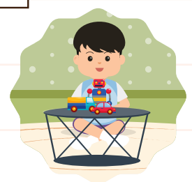
Extra time for a game