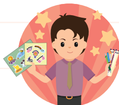
Offer small gifts