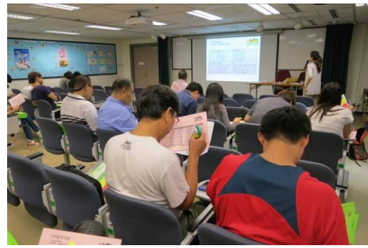
Participants paid their full attention to the lecture by DH's doctor & dietitian