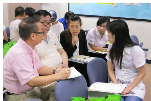
Group Activity: participants were divided into small groups to develop healthy and nutritious recipes.