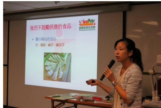
Doctor & dietitian explained the nutritional requirement of school children aged 6-12.